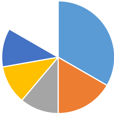
Figure 1: Sectors where AUK graduates and students are working/engaged in an internship

illustrates a diverse range of sectors in the research, representing the primary industries where AUK students and alumni have either undertaken internships or secured employment. The largest category is Government/Public (33%).