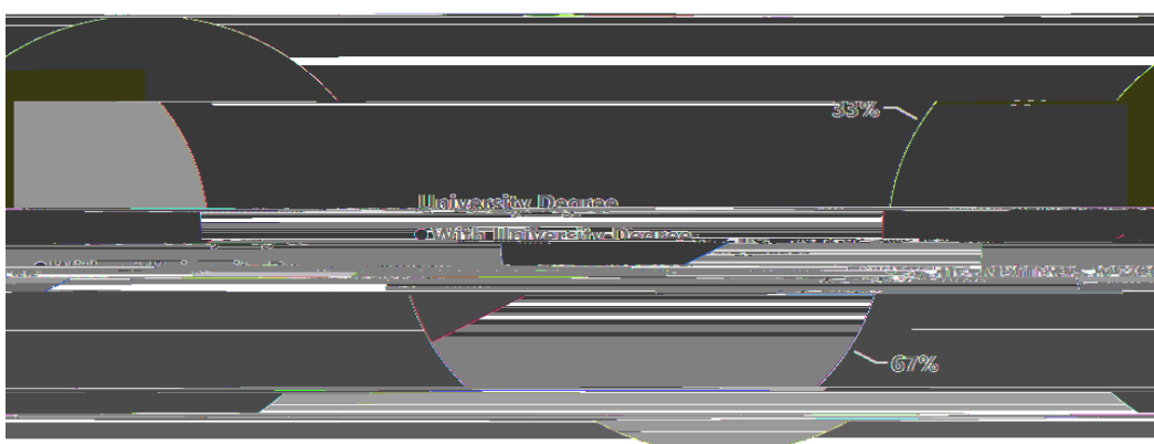
Figure 5: Employee Education

reflects the sex ratio, with the majority being male at 67%.